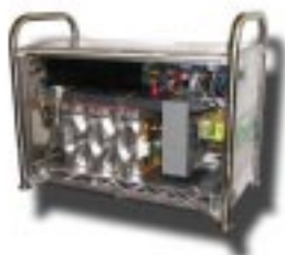
Enable's portable fuel cell

DCH Technology's subsidiary, Enable Fuel Cells, is developing fuel cells for mobile mini generators, providing power for lighting, communications, recreational vehicles, as well as police and military applications. IPS MeteoStar, a global supplier of remote data-logging systems, will begin distributing products with these fuel cells serving as the internal electric power supply. The fuel cells eliminate the problems with limited battery life and are impervious to bad weather.