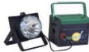
GreenVolt's products are available today.

GreenVolt Power Corporation is one company already offering small fuel cells for use in portable power and emergency power applications. The PM-60 magnesium/air/water fuel cell (MAWFC) includes a two function detachable lamp and operates at 6 volt and 2 amp continuous current for up to 50 hours. The electrolyte is saltwater or ocean water acting with magnesium anodes, and carbon cathodes to produce electricity. The unit weighs less than five pounds and operates without an external fuel supply source by utilizing energy contained in its lightweight metal anodes. GreenVolt is also beginning production of the GV-Flash(TM), a compact, inexpensive fuel cell emergency blinker that emits a red flash-visible day or night-every second, 24 hours a day for more than a week without any servicing.