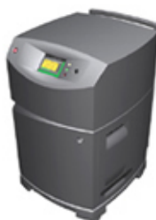
1 kW Hydrogen Power Module

Nuvera Fuel Cells has successfully demonstrated a natural gas fuel cell powering a Verizon telecommunication system. The joint effort between Nuvera and Verizon, which will span a two-year period, includes the development, testing and evaluation of fuel cell powered demonstration units in the 5 kW range. Such systems could be used in the future to provide primary or backup power for telecom switch nodes, cell towers, and other electronic systems that would benefit from on-site, direct DC power supply.